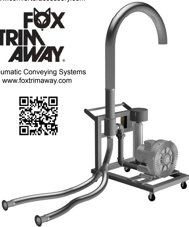
Two Pick-up FOX Runner™ Portable System