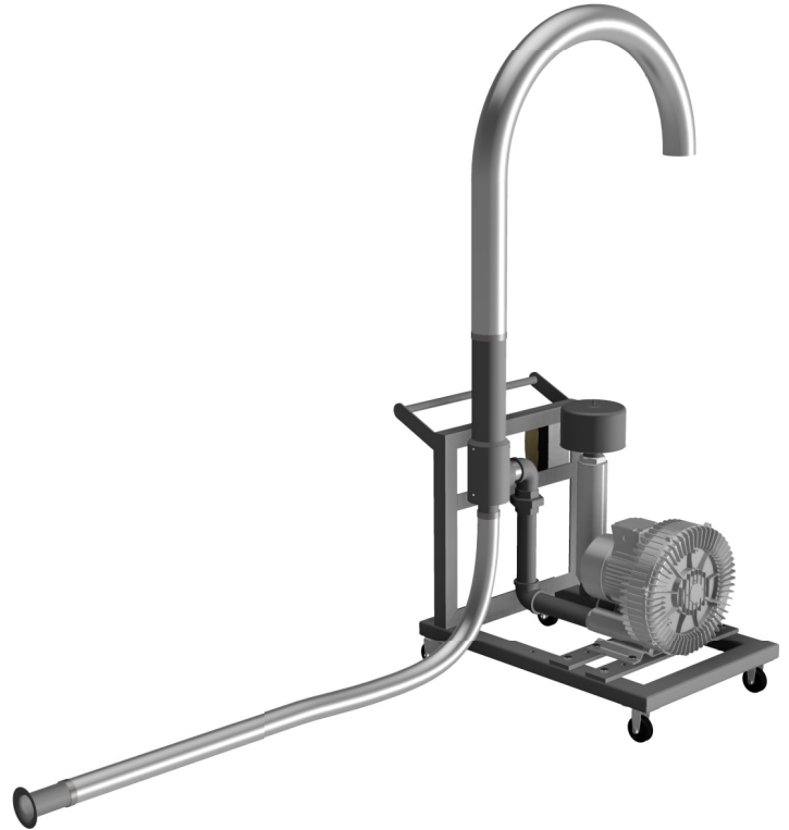
One Pick-up FOX Runner™ Portable System

For more information on this system, visit: