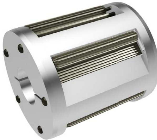
6" COR-LOK Mechanical Chuck