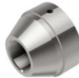
End Plug for 3" cores