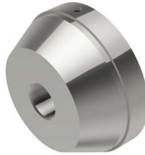
End Plug for 6" cores