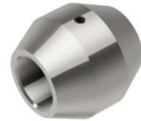
Center Plug for 3" cores