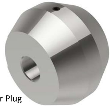
Center Plug for 6" cores