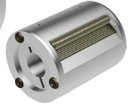
3" COR-LOK Mechanical Chuck

Sizes available in standard and metric for 2" - 18" cores